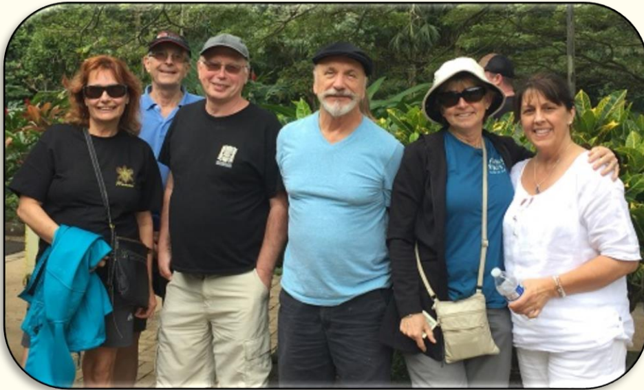
Some of the retreat participants in Hawaii