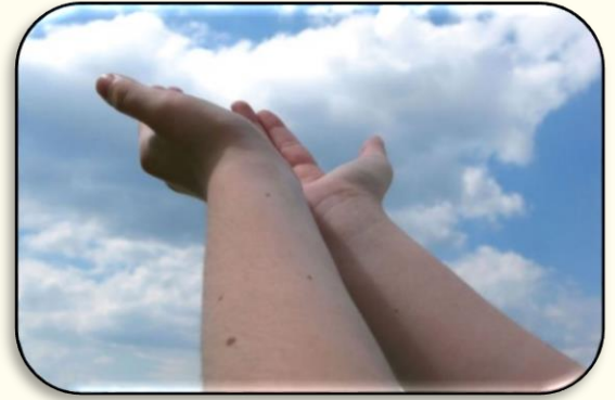
Sanja Gjenero, www.freeimages.com